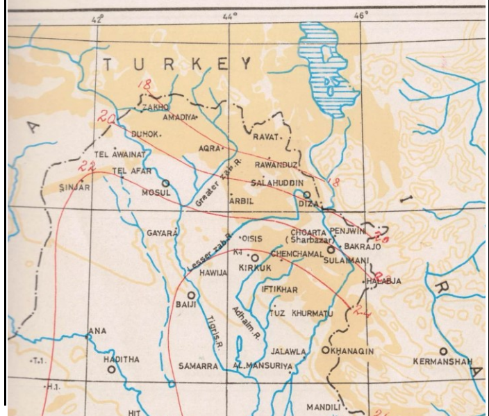
Sample extract of the Climatic Atlas of Iraq