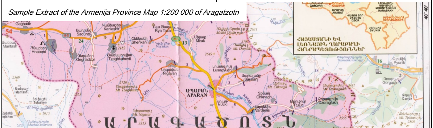
Sample Extract of the Armenija Province Map 1:200 000 of Aragatzotn